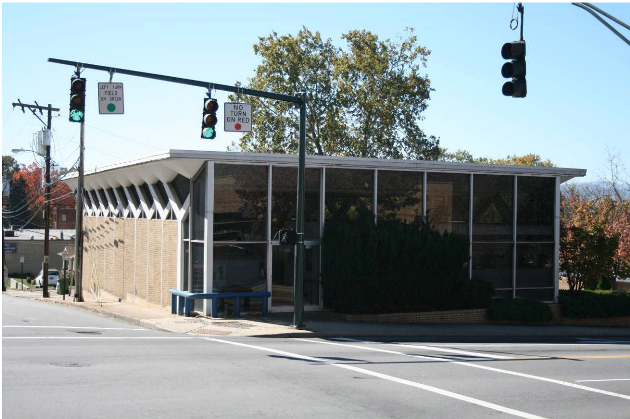
Public Service Company of North Carolina Office, 168 Patton Avenue