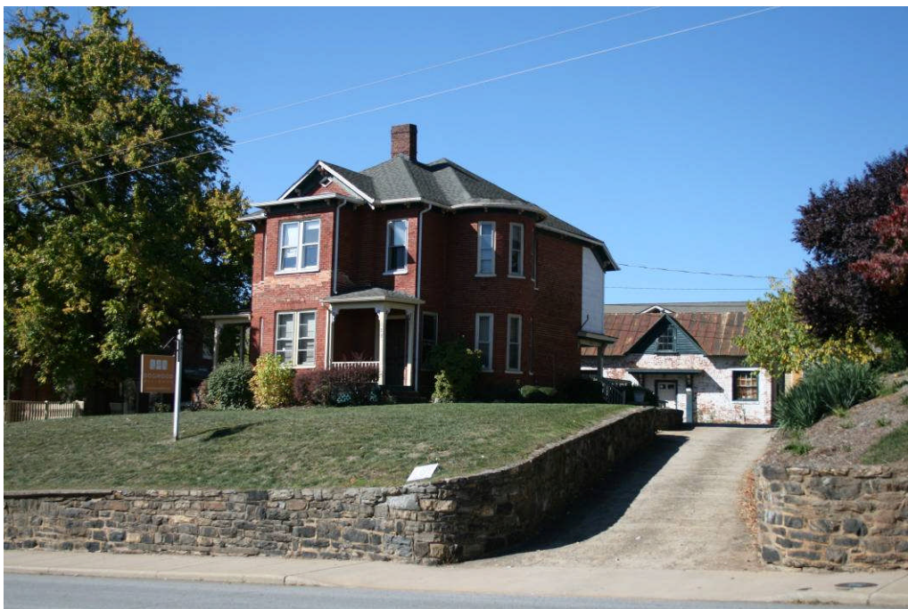
Carmichael – Leonard House, 129 Biltmore Avenue