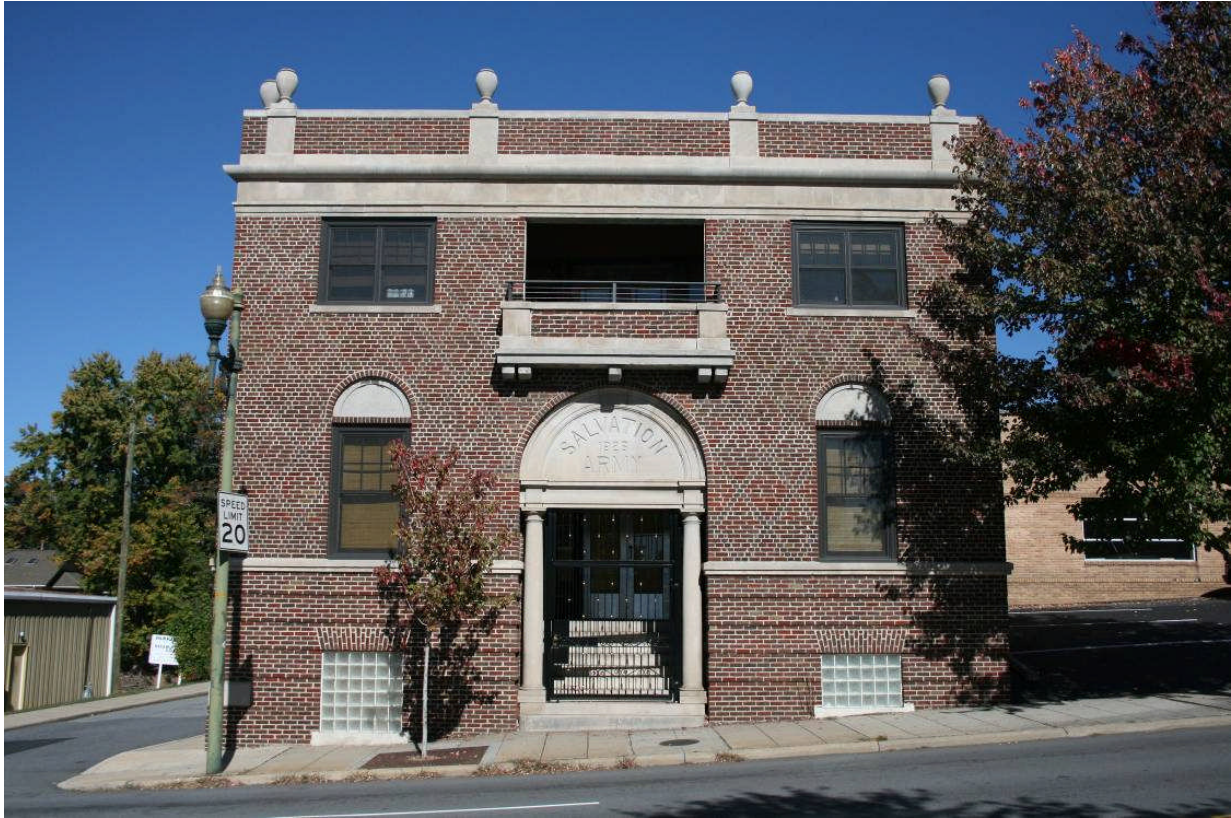
Salvation Army Building, 175 Patton Avenue