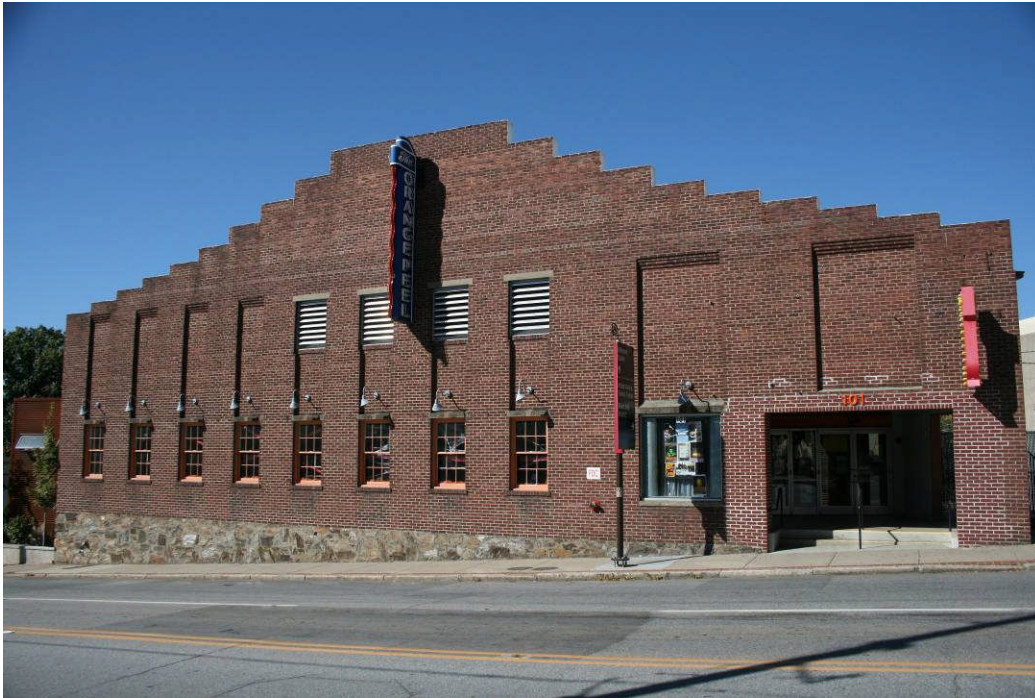
Skateland Rollerdom, 101 Biltmore Avenue

Photographs by Clay Griffith, October 2010