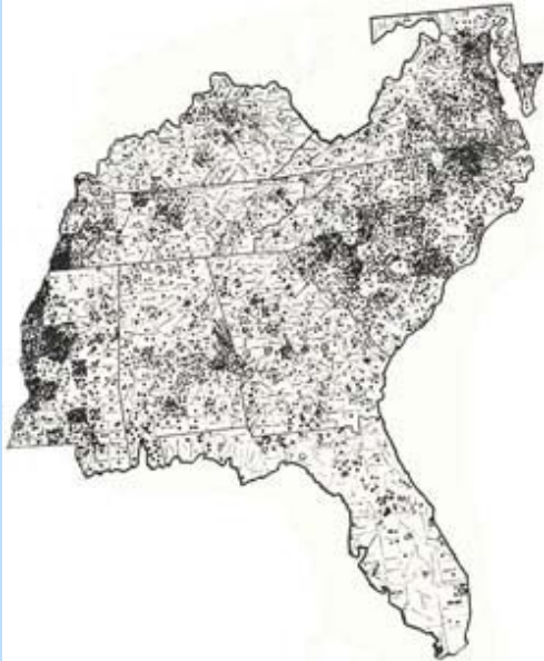
Rosenwald School Locator Map