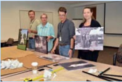
Staff from three divisions collaborate on prepping the photos for the exhibit