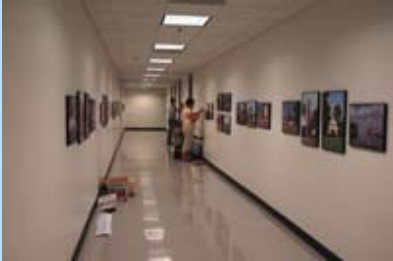
Staff members hang the exhibit