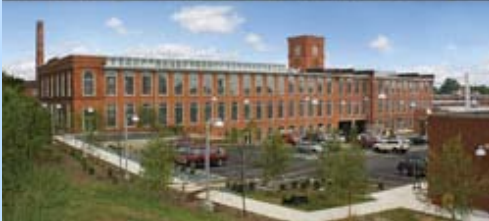
Before (top) and after (bottom) rehabilitation

Durham developer Scientific Properties recently received final approval from the HPO and the National Park Service that the rehabilitation undertaken on the former Golden Belt Manufacturing Company building, in Durham, qualifies for historic preservation rehabilitation tax credits. The complex, part of the National Register listed Golden Belt Historic District and dating from 1902, was constructed as a textile mill initially producing bags for loose tobacco products.