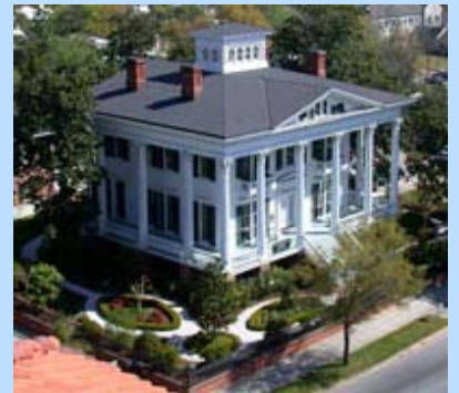
Bird's-eye view of Bellamy Mansion, Wilmington