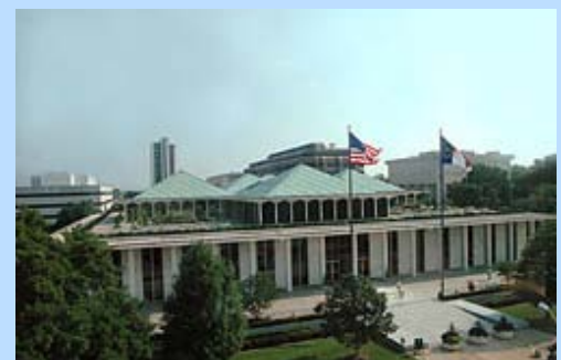
NC Legislative Building

Rehabilitation of North Carolina's historic buildings increased dramatically following the 1998 expansion of the state tax credit for historic structure rehabilitation and the creation of the new state tax credit for historic mill rehabilitation that began in 2006. Since 1998 state and federal historic and mill credits have encouraged over $1.3 billion of private investments in over 2,000 projects.