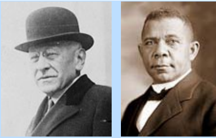
Julius Rosenwald (left) and Booker T. Washington (right)