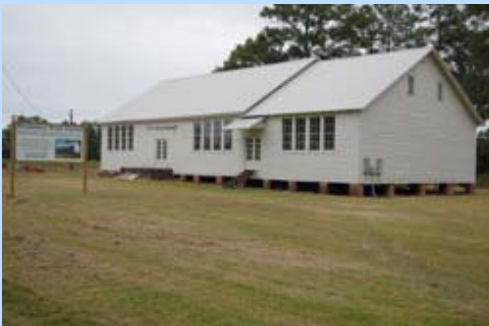
Hamilton School, Martin County, in 2009

Since 2001, the HPO has been coordinating a comprehensive survey of North Carolina's Rosenwald schools. Unlike typical surveys of historic architecture, this project is documenting both extant school building and those that are no longer standing. So far, the HPO has compiled files on 283 Rosenwald schools (more than one-third of North Carolina's projects), of which approximately 140 remain standing. Of the extant schools, 24 have been listed in the National Register of Historic Places and 41 are on North Carolina's National Register Study List (properties that have been evaluated as potentially eligible for listing in the National Register).