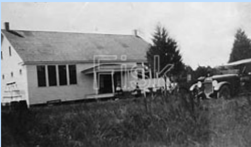
Hamilton School, Martin County, circa 1920, from Fisk database

The Rosenwald school building program was a major effort to improve the quality of public education for African Americans in the early twentieth-century South. In 1912, Julius Rosenwald gave Booker T. Washington permission to use some of the money he had donated to Tuskegee Institute for the construction of six small schools in rural Alabama, which were built in 1913 and 1914. Pleased with the results, Rosenwald then agreed to fund a larger program for schoolhouse construction based at Tuskegee. In 1917 he set up the Julius Rosenwald Fund, a Chicago-based philanthropic foundation that provided seed money for school construction and by 1920 also provided plans and specifications for state-of-the-art school buildings. By 1928, one in every five rural schools for black students in the South, housing one-third of the region's rural black schoolchildren and teachers, had received assistance from the Fund. At the program's conclusion in 1932, it had produced 4,977 new schools, 217 teachers' homes, and 163 shop buildings. North Carolina had the most Rosenwald Fund school projects with a total of 813.