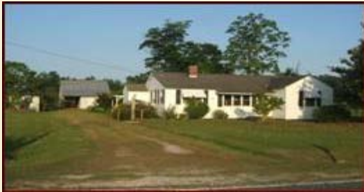
Typical Penderlea "Homestead"